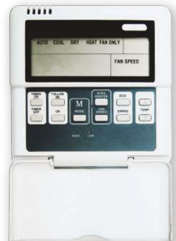
Optional wired controller